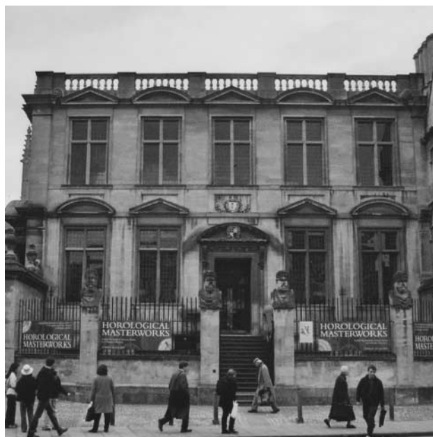
Figure 2. Museum of the History of Science, in the Old Ashmolean Building, Broad Street. The building was constructed in 1683 for the study and dissemination of the new philosophy of the seventeenth century.